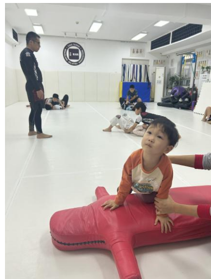
First Brazilian Jiu-Jitsu Trial Class