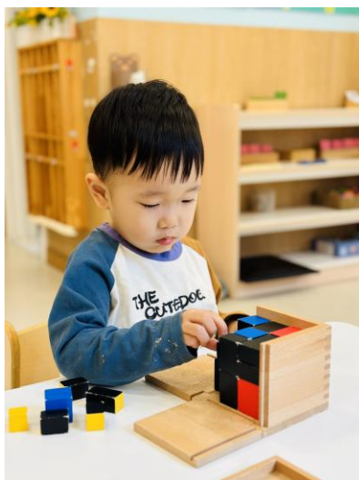
Montessori Trinomial Cube