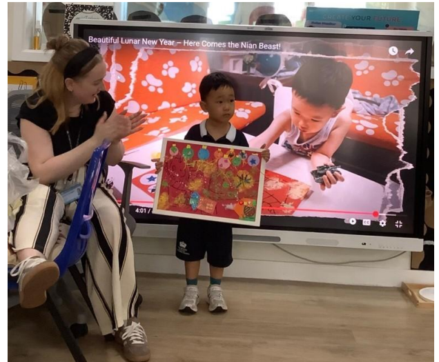
Artwork " Beautiful Lunar New Year – Here Comes the Nian Beast "