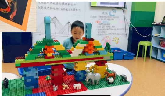
LEGO robotics projects completed independently by Ethan with teacher guidance, including the Eiffel Tower and a sea-crossing bridge.